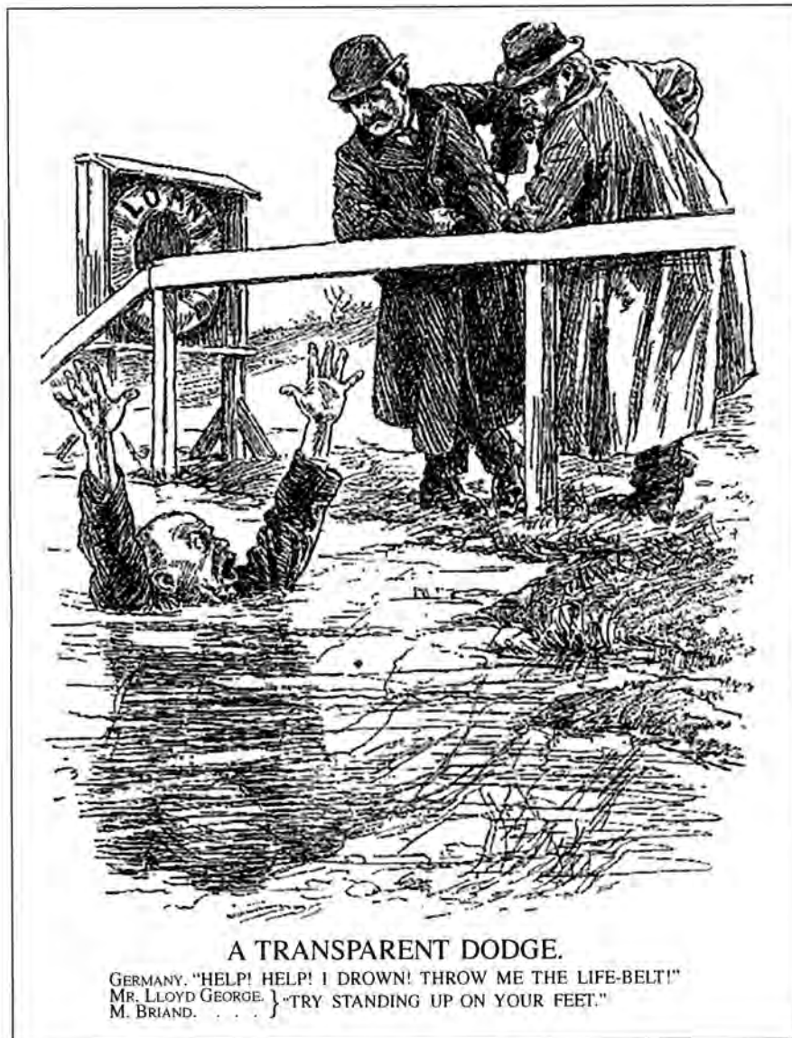
A cartoon published in Britain in 1921. Briand was the French Prime Minister.