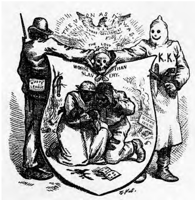
A cartoon entitled 'Worse than Slavery', published in 1874.