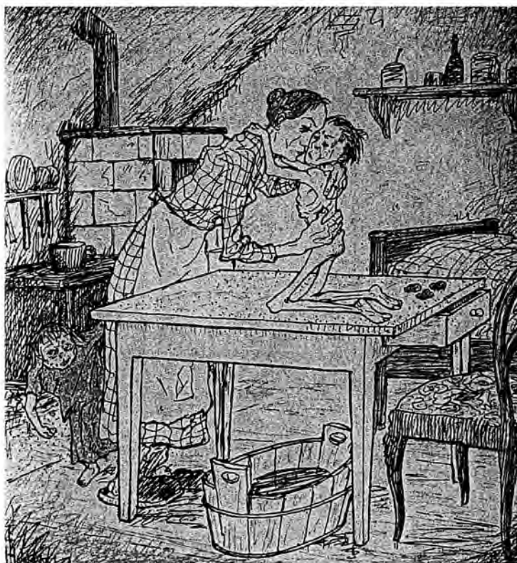
A cartoon entitled 'Consolation', published in a German magazine, June 1919. The mother is saying 'When we have paid 100 000 000 000 marks, then I shall be able to give you something to eat.'