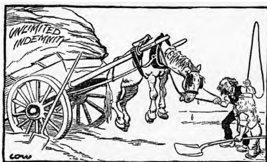
A cartoon published in Britain in 1921. Lloyd George is speaking to Briand, the French Prime Minister, and he is saying 'Perhaps it would walk better if we let it touch earth.'